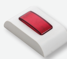
ALP-01 Remote indicator detector which is used for all types of output for indicator.