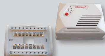
I-1007 Addressable Natural Gas Detector 24 VDC, Relay output