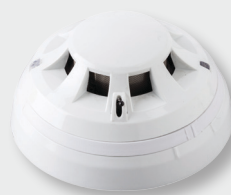
I-1002 Intelligent Multi Sensor Twin LED for 360 vision