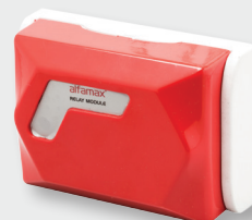
I-1052 Addressable Input Module Be connected device on / of the monitoring and contro module.