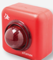
I-1006 Addressable Sounder allows easy installation