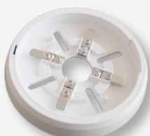
AXDZ-01 Standard Detector Base For C-1002, C1003, C-1004