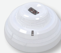
I-1004 Intelligent Ultraviolet Flame Detector Detect a 3cm flame at 6 meters.