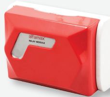
I-1054 Isolator Module be used after each 20 detectors Isolates a designated area