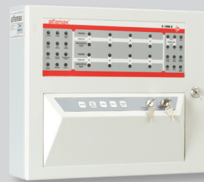
C-1000-4R / 4 Zonlu Conventional Fire Alarm Panel C-1000-8R / 8 Zonlu Conventional Fire Alarm Panel C-1000-16R / 16 Zonlu Conventional Fire Alarm Panel

2 siren outputs, testing and discharge day / night mode setting, normal, error status, alarm display cases, short circuit and open circuit alarm and replace the identified regional identifying feature of external connec- tions, standard relay outputs.