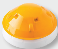
ALP-00 Detector Protection Cover Cleaning and the paint effect be used for protection be used for protection.