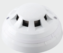
I-1001 Addressable Optical (Photoelectric) Smoke Detector Double Led