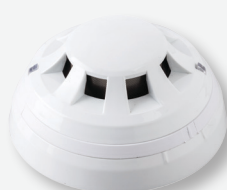
R-1001 Relay Optical Smoke Detector Double led