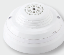
R-1003 Relay Heat Increasing Speed Dedektörü normally closed contact N/C For security panels 24V and 48V