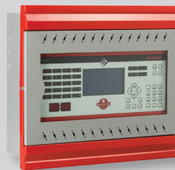
I-1000-1R Repeater Panel Compatible Whit I-1000-1, I-1000-2, I-1000-3, I-1000-4 Recessed and surface type mounting