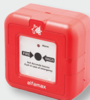
I-1005 Addressable Manual Call Point Addressable Manual Call Point (MCP) with re-settable (non breakable) glass