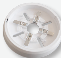
AXDZ-01 AX DB-01 Detector Base For I-1001, I-1002, I-1003, I-1004 dedectors.