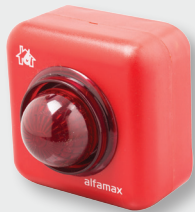
C-1006 Conventional Sounder 12V/ 24V/ 220V options.