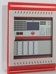
I-1000-1 1 Loop Addressable Fire Alarm Panel I-1000-2 2 Loop Addressable Fire Alarm Panel I-1000-3 3 Loop Addressable Fire Alarm Panel I-1000-4 4 Loop Addressable Fire Alarm Panel • 240x123 Big Screen • 250x4 Address Capacity • 32 Zone, 2 Siren Line • Recessed and surface type mounting options