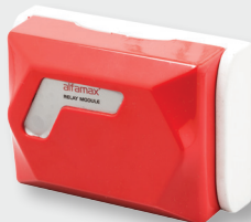
I-1050 Addressable Sounder Circuit Module Regional siren operating or mute feature