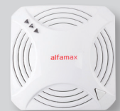
C-1007 Natural Gas Detector Gas-controlled, 12 / 24V DC or 220V AC supply, regional alarm signal and relay outputs.