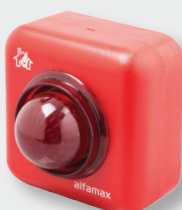
I-1006 F Addressable Sounder and Strobe Strobe provided by high intensity LED cluster