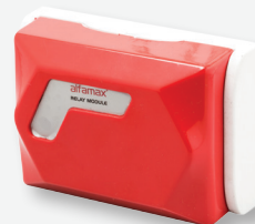
I-1051 Intelligent Single Input/Output Module Ensures that all relay controls. Available with 220 volts.