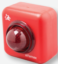
C-1006 F Conventional Sounder and Strobe 12V/ 24V/ 220V options.